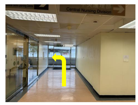
6. Through the door, turn left