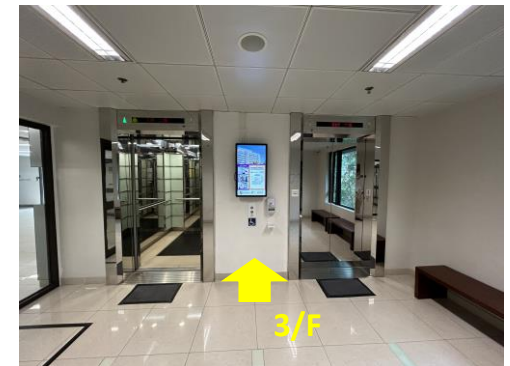
10. Take a lift, press 3