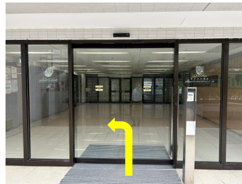
9. Through the autodoor, turn left