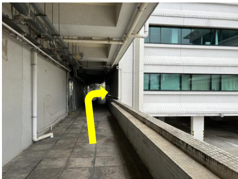
7. Walk on the steep, turn right