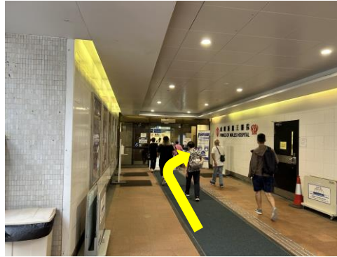
2. Through the autodoors, turn right