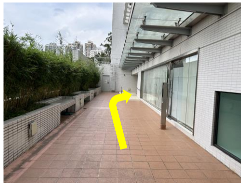
8. Go straight, turn right