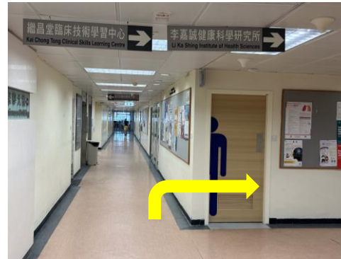
5. When see male toilet, turn right